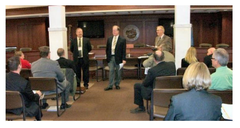
RIGHT: The judges are trained before the competition.