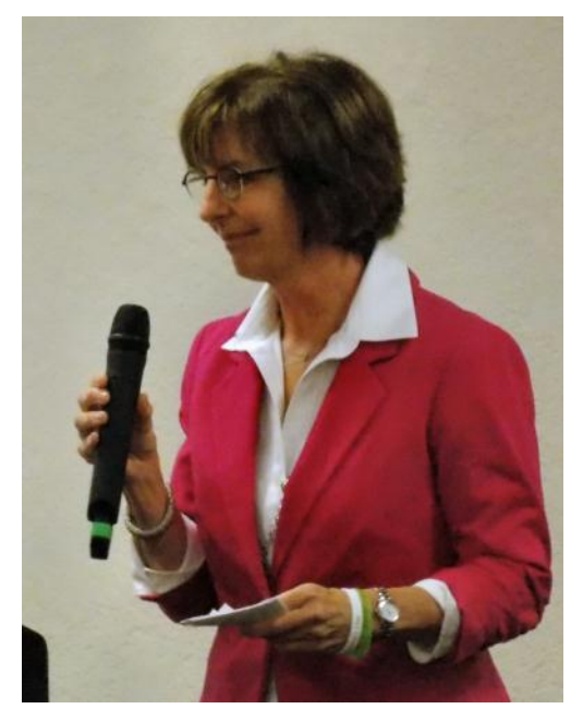
Above: Justice Wilbur at the Drug Court Symposium introduced the Parade of Transformation.