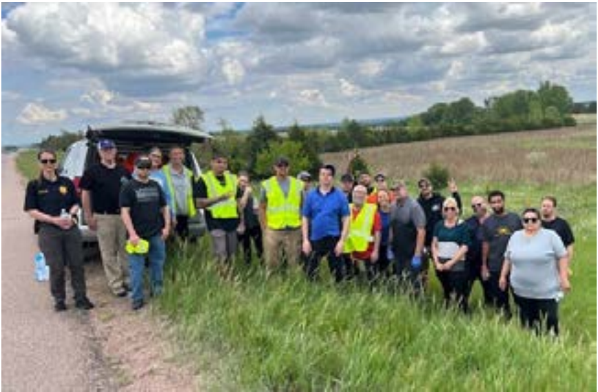
Yankton County Drug & DUI Court participants and team members picked up litter along a section of state highway on May 28, 2025.

On January 28, we will hold two treatment court sessions in the Supreme Court Courtroom here at the Capitol. Every legislator is invited to attend either session. This will provide you with a firsthand opportunity to observe a treatment court session and hear from members of the drug court team. I hope you will all attend.