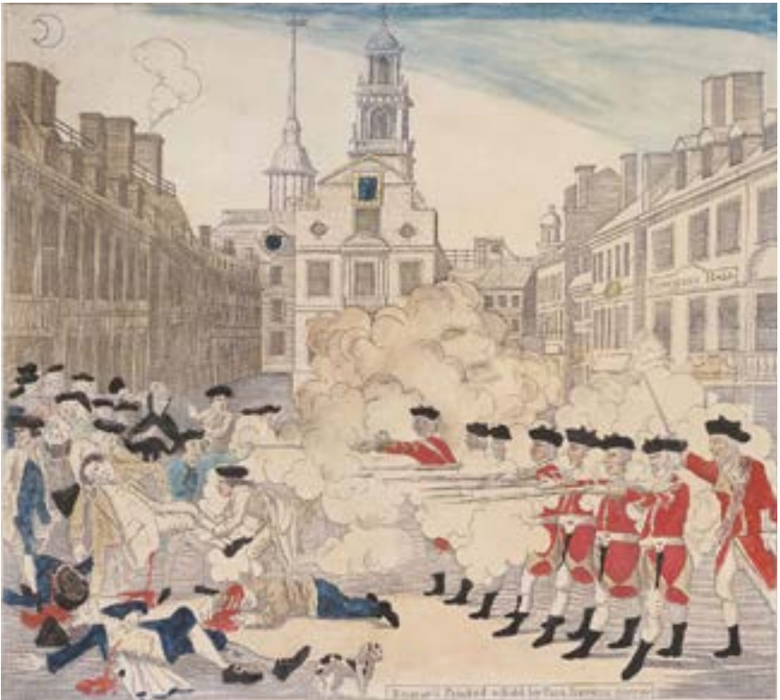
Boston Massacre print by Paul Revere Jr.

The British captain was tried first. He was acquitted by an independent jury based upon testimony of several eyewitnesses who stated that the captain had not fired his weapon and had not ordered the troops to fire into the crowd. The other eight British soldiers were later tried on murder charges and were also represented by Adams. Following six days of testimony from dozens of witnesses, a jury found two of the soldiers guilty of manslaughter after hearing