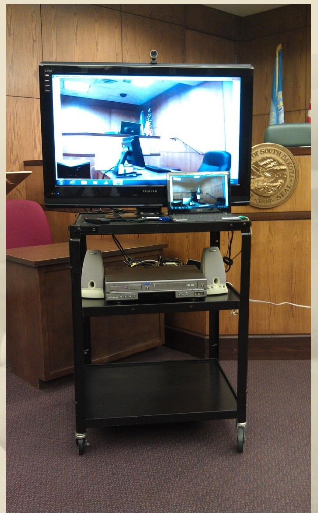
Webcam/ Laptop Unit