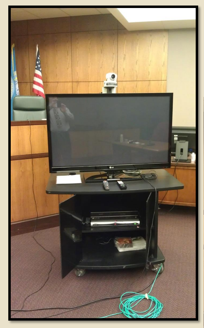
State Video Network