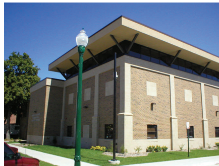
Yankton County Courthouse.

An open house of the facilities was held before the dedication. Several hundred Yankton County residents took the oppor-