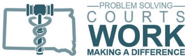
Problem Solving Court Locations South Dakota Unified Judicial System