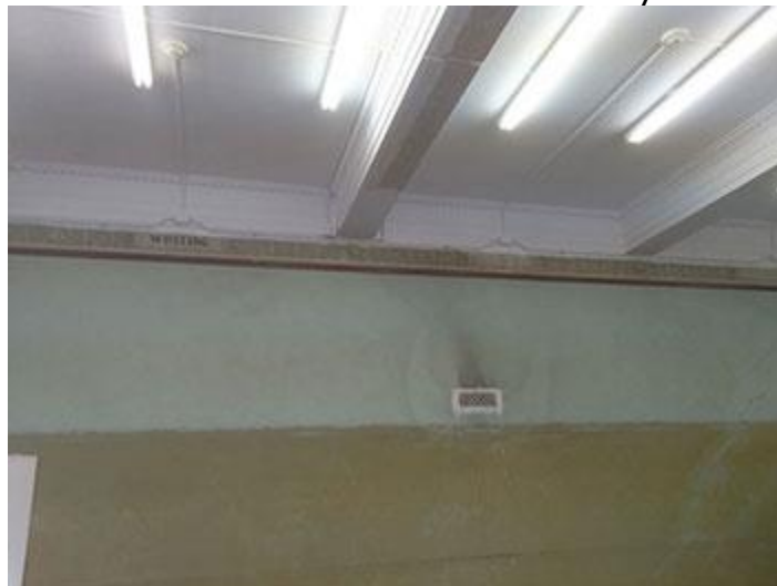
Left wall of the library