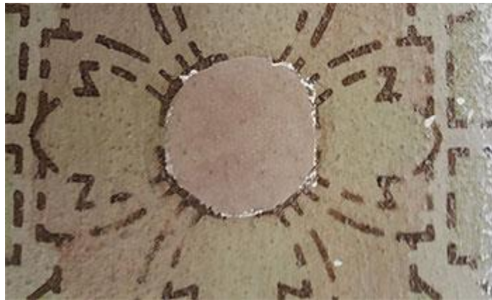
Flower artwork closeup with suspected silver paint behind the middle of the flower