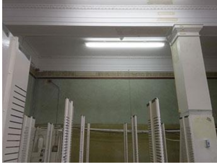
Artwork as shown after the second-floor removal