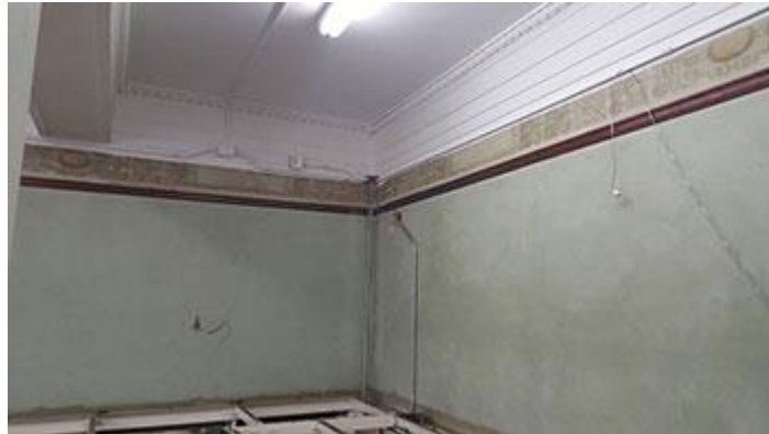
Back left corner of the library