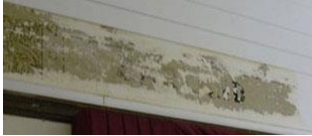
The first name found