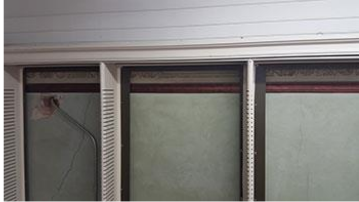
Artwork revealed by the bookcase removal