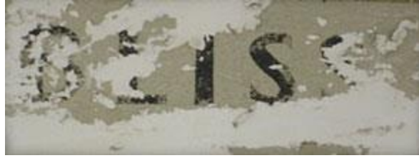
Bliss's name found