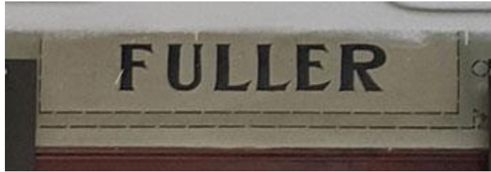
Fuller's name revealed after bookcase removal