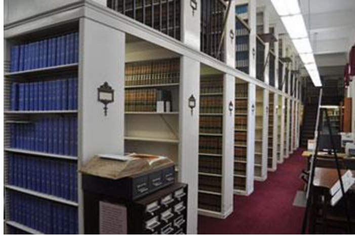
Photo of the library before renovations began