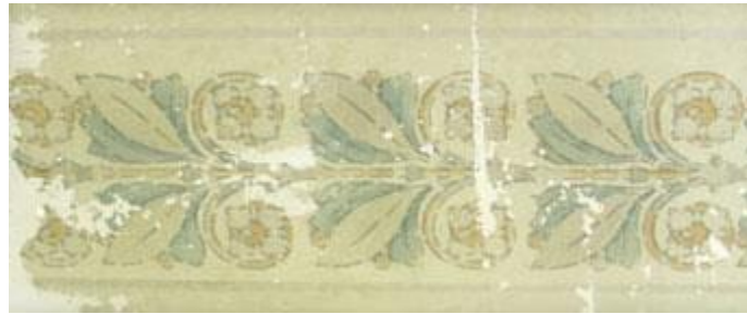
First artwork found on the ceiling joists