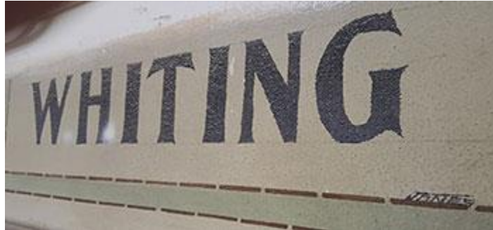
Whiting's name revealed after bookcase removal