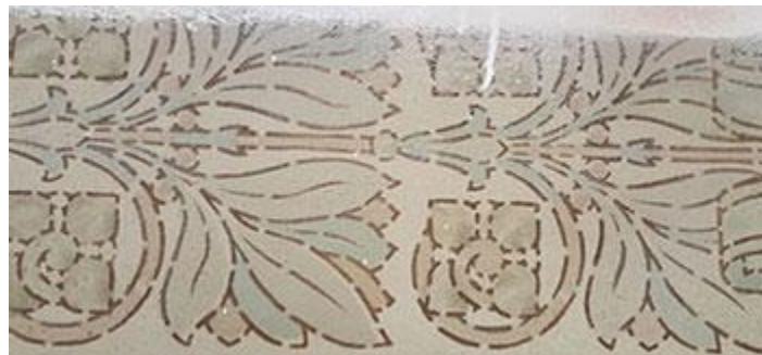
Close up of wall artwork