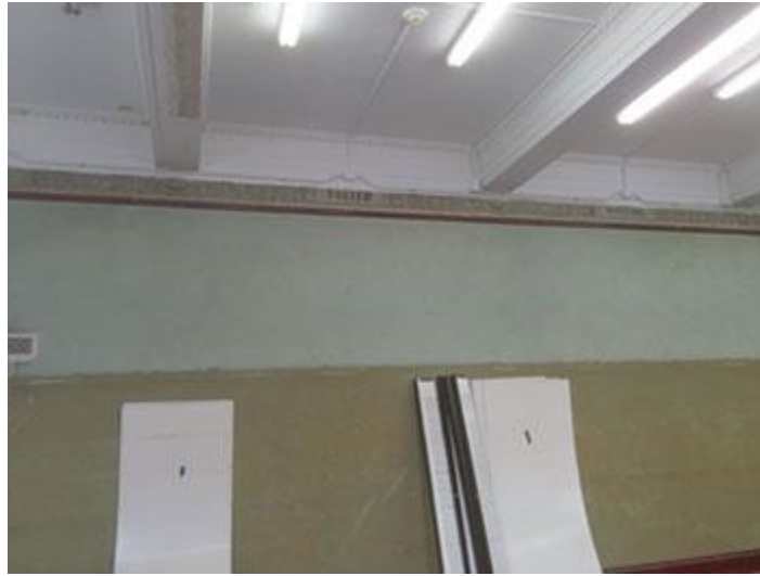
Left wall of the library