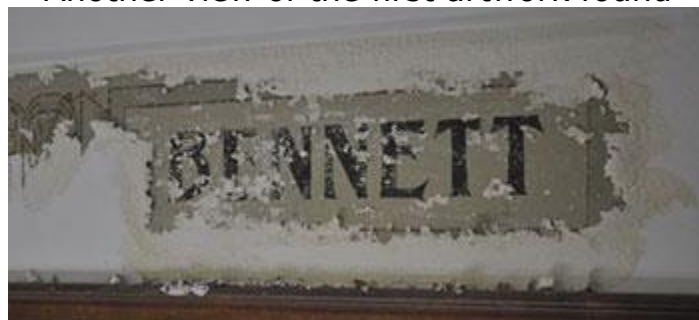
Bennett's name found