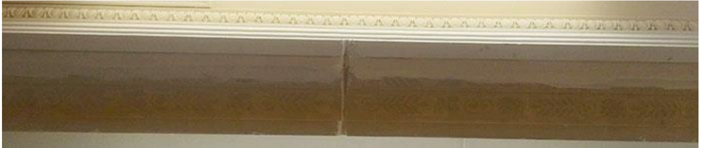
Ceiling artwork revealed after bookcase removal