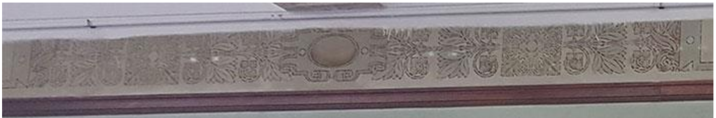
Wall artwork revealed after bookcase removal