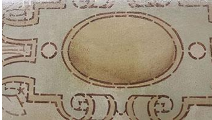
Close up of wall artwork