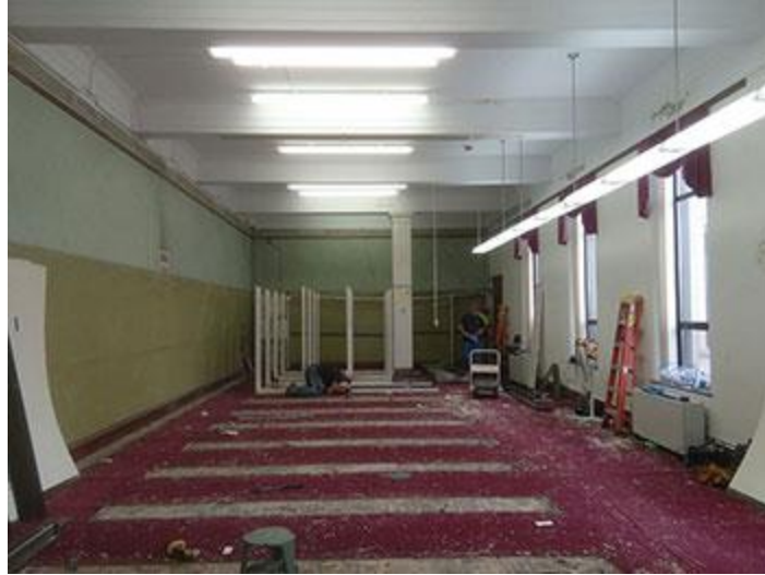
Entire view of the library