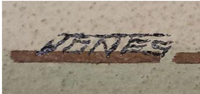
Artist's signature revealed on Whiting's name painting