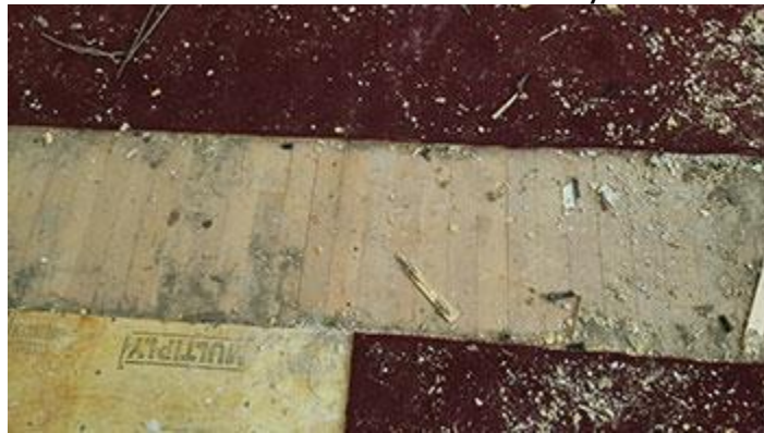
View of the library revealed wood floor