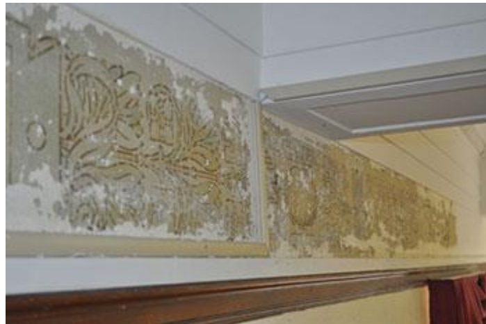
Another view of the first artwork found