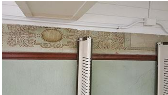
Another view of the artwork behind the bookcases