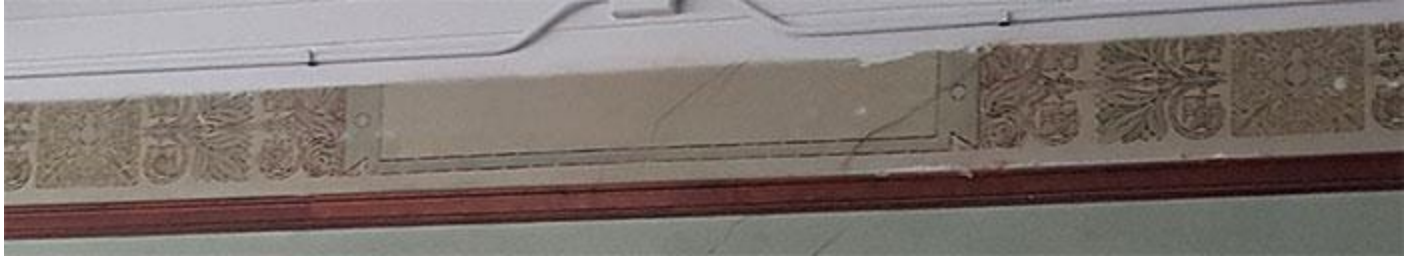
Wall artwork revealed after bookcase removal