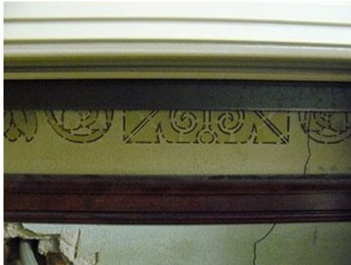
Hidden artwork that started the restoration