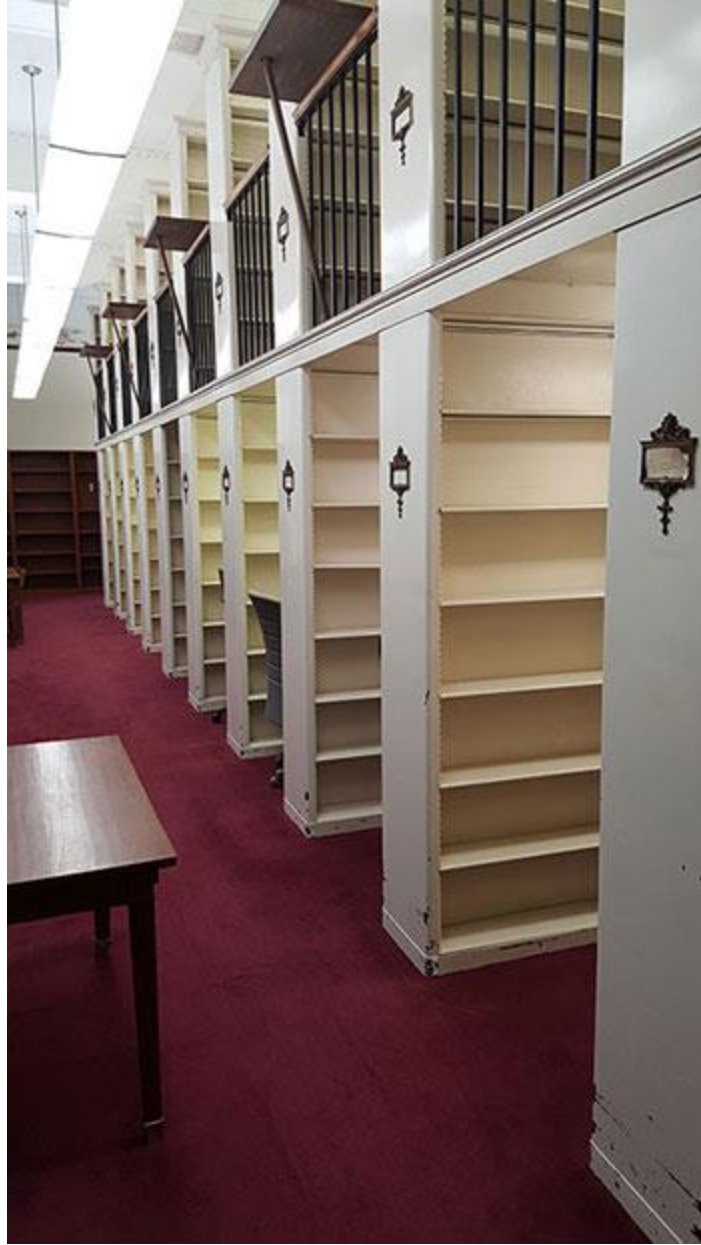
Another view of the library after equipment and book removal