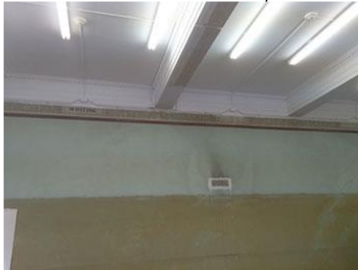
Left wall of the library