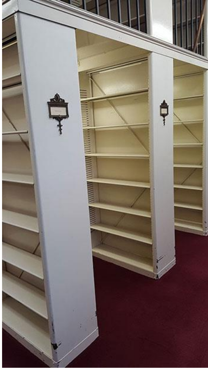
Library after equipment and book removal