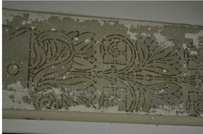
The first artwork found