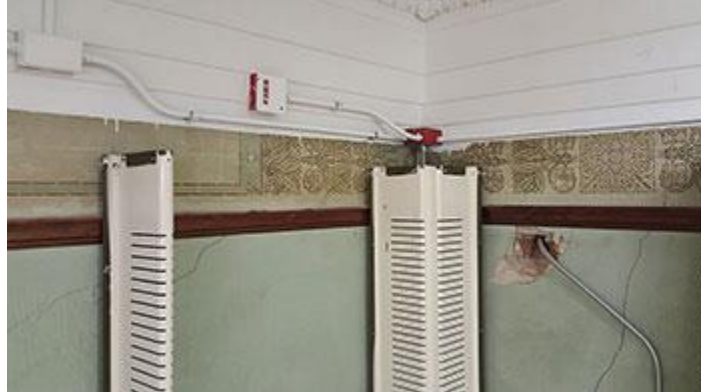
More reveal as bookcases were removed