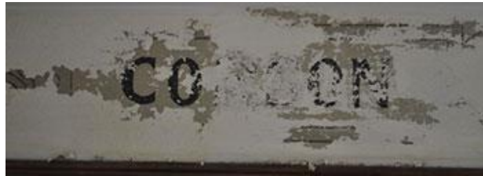
Corson's name found