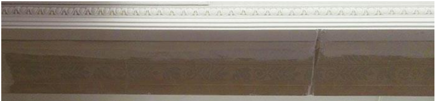
Ceiling artwork revealed after bookcase removal